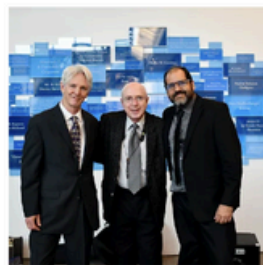
FAMILIES HELPING FAMILIES