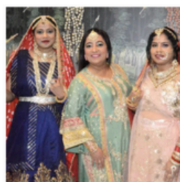
AFTER HOURS AT THE SPEED