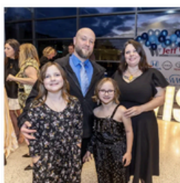
MAKE A WISH GALA